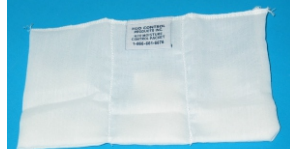
3"x 7" Packet

Our 3"x 7" Packets protect 8 cubic feet enclosures. The part# is H2O373T. 3"x 7" packs sold in cases of 10 units.