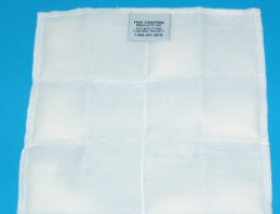
7"x 7" Packet

Our 7"x 7" Packets protect 20 cubic feet enclosures. The part# is H2O776T. 7"x 7" packs sold in cases of 10 units.