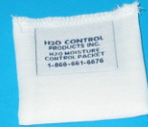
2"x 2" Packet

Our 2"x 2" Packets protect 3 cubic feet enclosures. The part# is H2O221T. 2"x 2" packs sold in cases of 25 units.