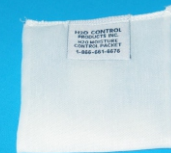
3"x 3" Packet

Our 3"x 3" Packets protect 5 cubic feet enclosures. The part# is H2O331T. 3"x 3" packs sold in cases of 10 units.